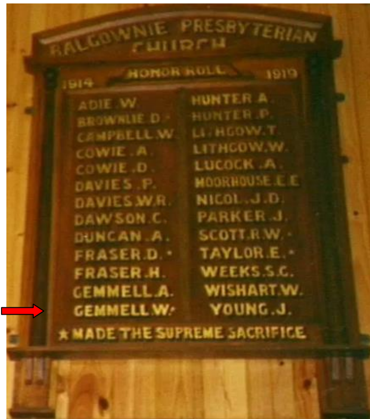
Balgownie Presbyterian Church Roll of Honour