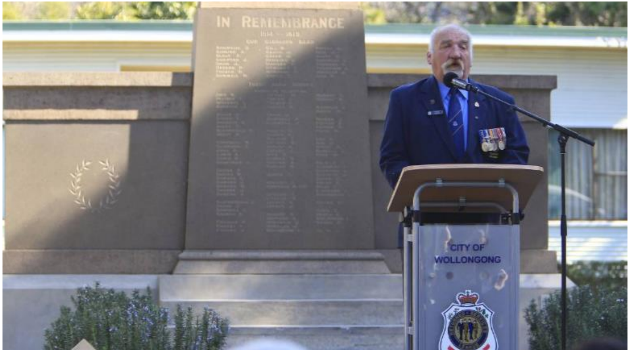
Balgownie War Memorial