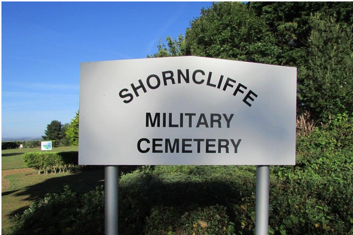
Shorncliffe Military Cemetery, Folkestone